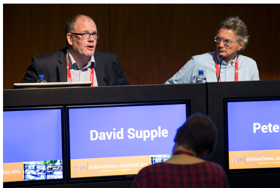
U-BIOPRED Project Coordinator and the Chair of Patient Input Platform lead an educational session on how to involve patients in research projects at the ERS International Congress