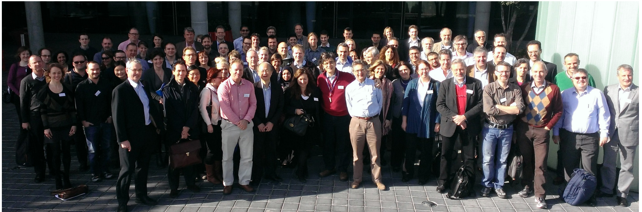
U-BIOPRED consortium members at the Annual General Meeting

The U-BIOPRED project and research leading to these results have received support from the Innovative Medicines Initiative Joint Undertaking under grant agreement n° 115010, resources of which are composed of financial contribution from the European Union's Seventh Framework Programme (FP7/2007- 2013) and EFPIA companies' in kind contribution.