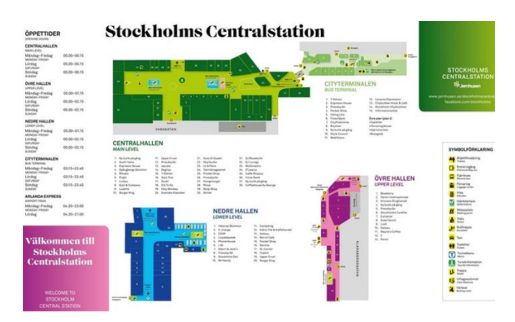
Map of Stockholm Central Station, final destination of all the connection from/to the airport.

If you want to opt to travel to Stockholm by rail, SJ offers direct trains from Oslo, Copenhagen and from other destinations within Sweden. Please, consult <u>SJ official page</u> for extra information.